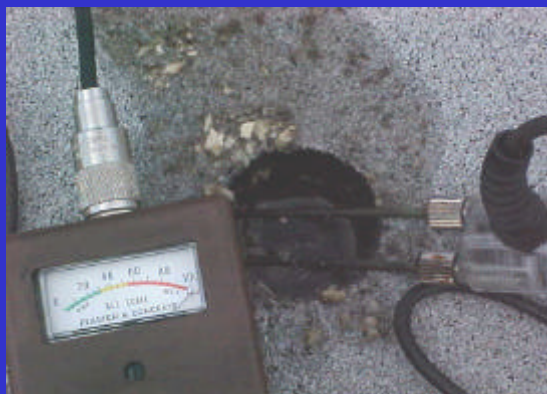
Roof Core and Moisture Meter Reading

An infrared thermographic moisture survey is a non-invasive method for identifying areas of the roof that contain entrapped moisture within the roof assembly. The survey can be performed for the following purposes: 1) As a supplement to a roof condition assessment; 2) For annual inspection/maintenance programs; 3) Verification and/or documentation of physical damage of a roof due to storm/weather related events or other natural or man-made physical force; or 4) Determination of baseline roof condition upon completion of the new installation.